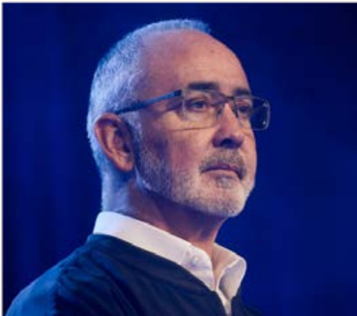
UAW International President Shawn Fain

THANKS TO AN AGGRESSIVE NEW UAW leadership, a six-week “stand-up” strike, and outside picket-line support that included DSA, the Big Three automakers agreed to a contract worth more than the last four contracts combined. (see Picket Lines Are The Front Lines of Working Class Struggle , p.1)