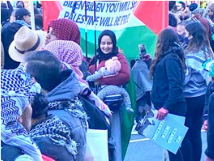
11/4 Cease Fire Demo in DC.

10/3 - DSA members join Local 2177 on the Picket Line at Langhorne, PA.